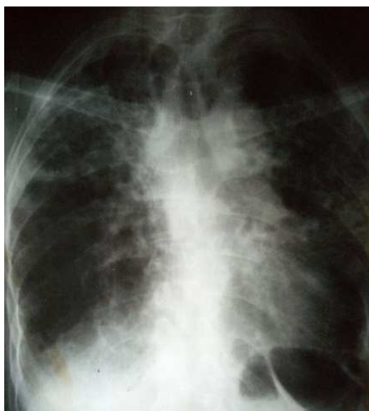
Figure 3. Sequelae of MDR-TB (pulmonary fibrosis).